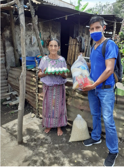
Delivering food baskets to an elder.

These are difficult times for everyone, and the elders at the Elder Center are no exception. As the hardest hit age group during the pandemic, we have done everything possible to keep the elders safe. The elders have been asked to stay at home, wash their hands, and wear a mask.